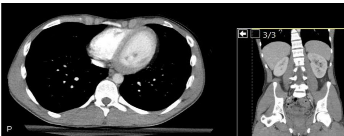
Figure; CT scan of a normal abdomen and pelvis, in sagittal plane, coronal and axial planes, respectively.

pressure on the radiologist significantly. Solutions such as Aidoc go through the vast quantities of images, flagging those that the AI consider to be of concern. The radiologist can then assess the flagged images as a matter of priority, thereby catching urgent cases faster without compromising on their existing workloads or cases. Aidoc has obtained 6 FDA/CE clearances for the flagging and prioritization of acute abnormalities in CT scans and is already deployed and showing value at over 400 medical facilities across the world. Artificial intelligence in medical diagnosis is still on the edge of its potential. There's plenty of room for growth and for the technology to improve on what it can do to support the medical profession. AI as it stands today is already being integrated into practice and workflows, and as it continues to evolve and change and adapt, it will likely step up to give the medical profession a reliable set of tools that can aid in diagnosis, workflow, admin and workload.