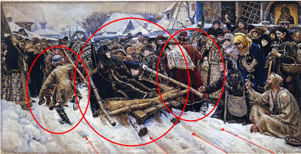
Figure 1. V. Surikov "Boyarina Morozova"